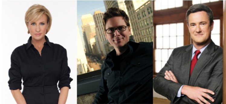
Greenbuild 2012 speakers: Mika Brzezinski and Joe Scarborough of "Morning Joe"; Biz Stone, co-founder of Twitter, Inc.