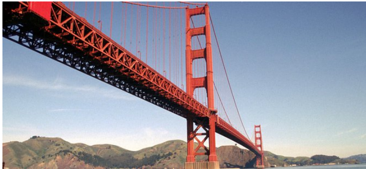
Follow the Golden Gate Bridge.

Published on 7 Aug 2012 Written by Mara Baum , Mara Baum Posted in Greenbuild