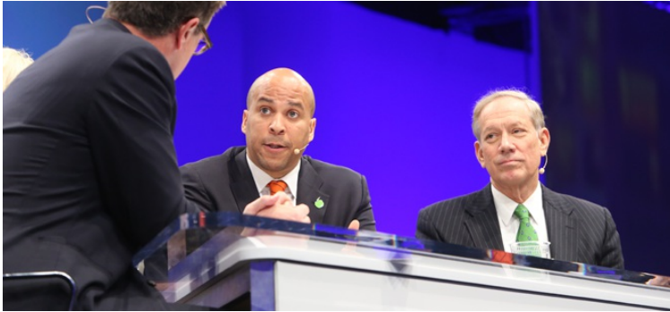
Joe Scarborough poses questions to Cory Booker and George Pataki at the Greenbuild Opening Plenary

Of all those speakers during the opening plenary session, I'm not sure I can pick out one who was clearly more compelling than the others. They all brought some amazing insights to the table.