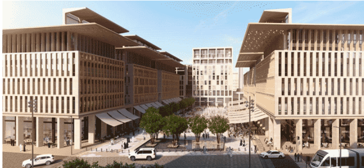
Msheireb Downtown Doha

In conjunction with the United Nations Framework Convention on Climate Change (UNFCCC) Conference of Parties 18 (COP18), the U.S. Green Building Council and Qatar Green Building Council would like to invite you to a special event on the growth of green building design and construction throughout the world. The event will highlight the notable Msheireb Downtown Doha. With the fifth greatest number of LEED registered and certified buildings outside the U.S., Doha is a fitting backdrop to discuss the booming green building industry and economy.