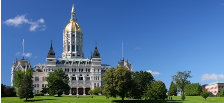
The Connecticut State Capitol in Hartford.

What's better about a brand new year than top 10 lists? There's already been a 2012 top 10 list for scientific discoveries , for Latin alternative albums , for Michelle Obama's outfits and even a Top 10 Everything... So in addition to last week's announcement about the top 10 states for LEED project activity in 2012, I'm here to pile on and add a top 10 list for state policies that propel green building forward.