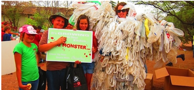
The Trash Monster at Greenway

Published on 27 Feb 2013 | Written by Molly Hislop | Posted in Center for Green Schools