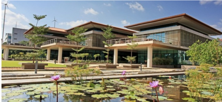
Sulzon on Earth, LEED Platinum. Pune, India.