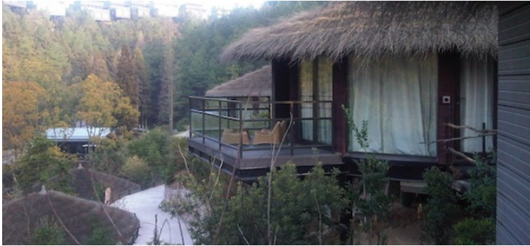
View of a naked Stables villa

With LEED projects in 135 countries around the world, it is safe to say, LEED is everywhere. Even on 60 acres of bamboo forest and white tea plantations in China.