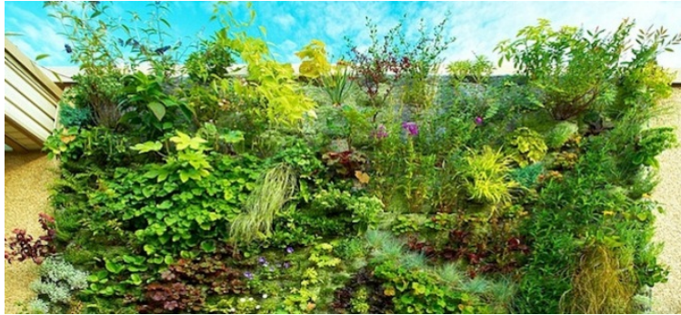
Rachel Gutter will be building green living walls on the Today Show on Earth Day.

Earth Day is just around the corner, and while USGBC believes that every day is Earth Day, we can't resist packing our schedules with a long list of events to celebrate an opportunity to promote healthy, sustainable buildings. Here are a few of the events we have lined up over the next two weeks. We hope to see you out there.