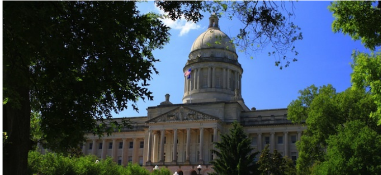
The Kentucky State Capitol.

Since the beginning of 2013, the Center for Green Schools at the U.S. Green Building Council has followed more than 90 bills across 30 states that seek to advance healthy, high-performing schools. This number is up even from last year, and continues to validate what our movement has long understood – that there’s a lot of common ground around the potential that healthy, high-performing schools provide (see our related advocacy campaign ).