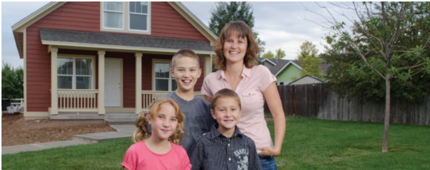
LEED Gold-seeking home built by Fort Collins Habitat for Humanity

Imagine a world where potential is not governed by what we're told to be, the only fear is not giving enough, and business-as-usual, is a little more...unreasonable.