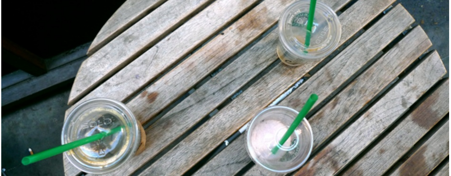
Starbucks re-imagines their stores

Our weekly collection of green building clips. Share your good reads of the week in the comments below.