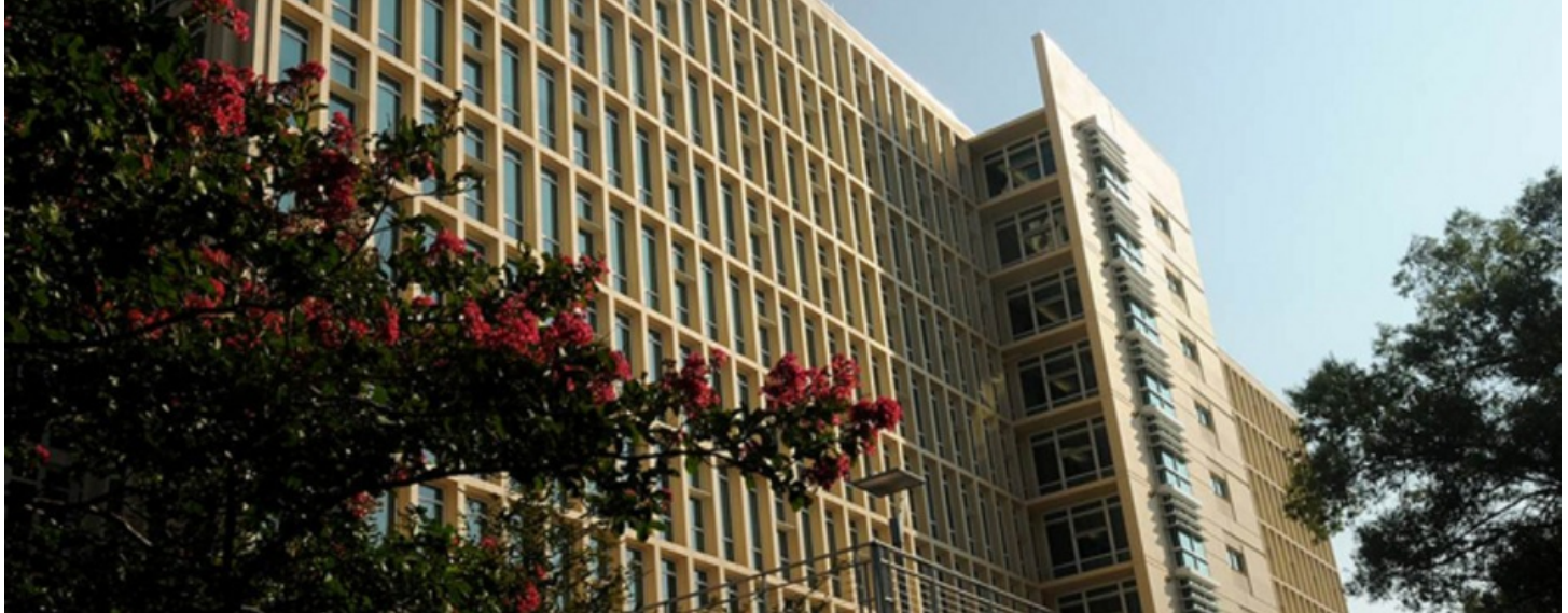
University of South Carolina's new LEED Gold, women's residence hall.

Our weekly collection of green building clips. Share your good reads of the week in the comments below. Have a great weekend!