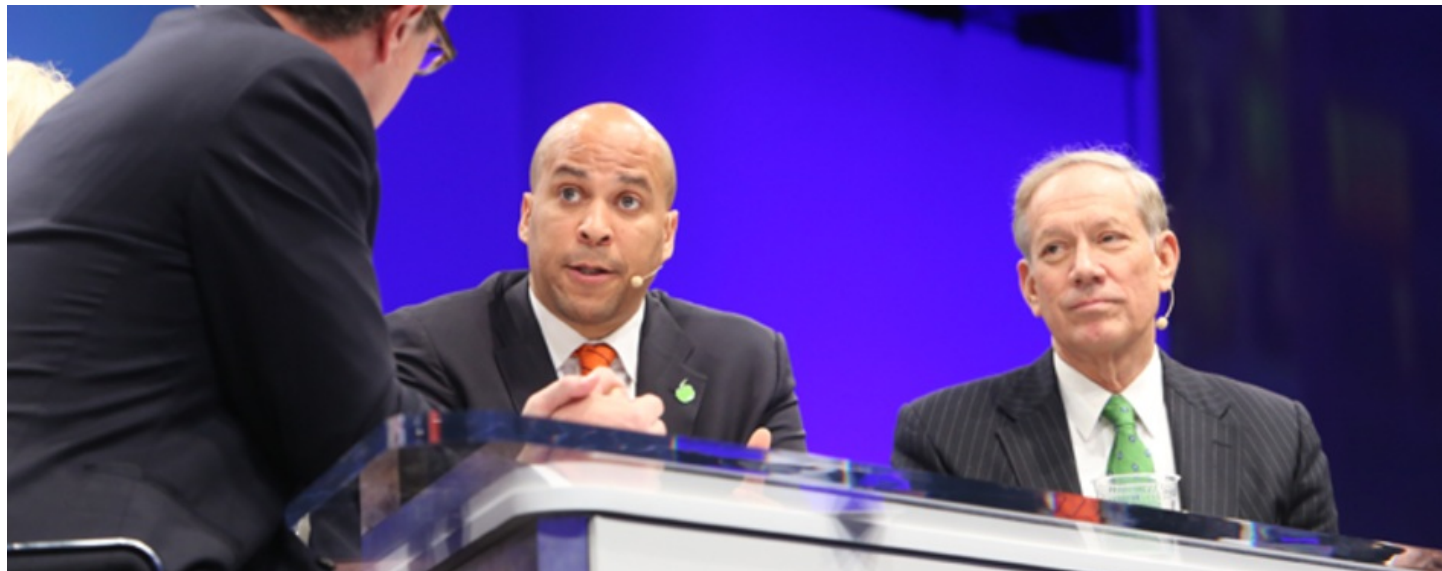
Joe Scarborough poses questions to Cory Booker and George Pataki at the Greenbuild Opening Plenary

Of all those speakers during the opening plenary session, I'm not sure I can pick out one who was clearly more compelling than the others. They all brought some amazing insights to the table.