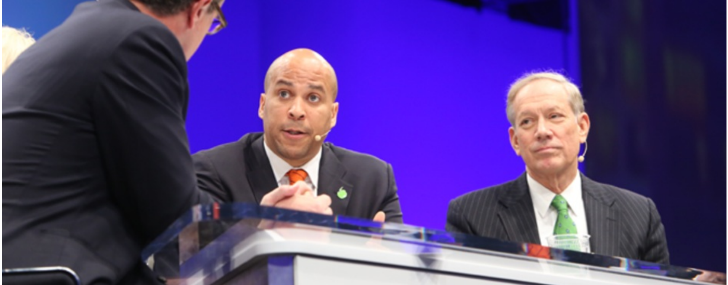
Joe Scarborough poses questions to Cory Booker and George Pataki at the Greenbuild Opening Plenary

Of all those speakers during the opening plenary session, I'm not sure I can pick out one who was clearly more compelling than the others. They all brought some amazing insights to the table.