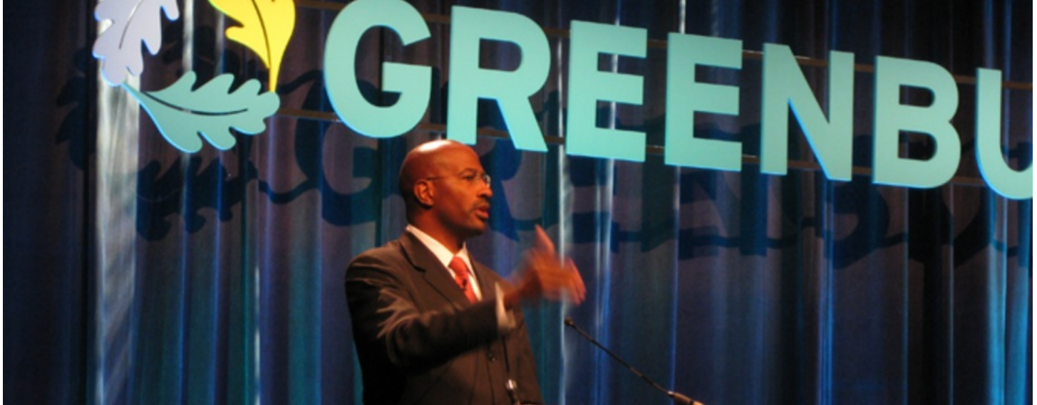
Van Jones at the Greenbuild Green Jobs Summit

Prolonged applause, two standing ovations, a full crowd erupting in inspired conversation. The closing keynote of the Green Jobs Summit provoked meaningful conversations on the role of green jobs for both economic and social prosperity. The former White House green jobs advisor, Van Jones, was a fitting cap to the third annual Green Jobs Summit at Greenbuild, hosted in partnership with the Center for American Progress and the BlueGreen Alliance.