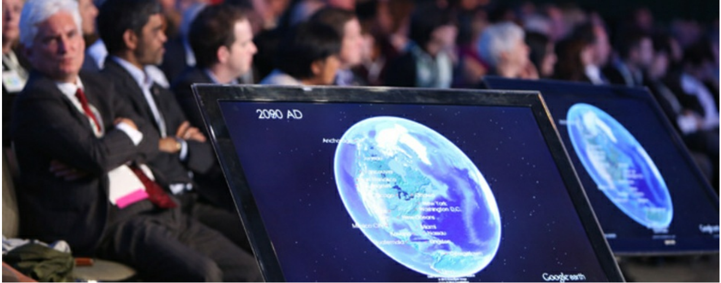
Greenbuild 2012 Closing Plenary

Governor Jerry Brown, Jane McGonigal and William McDonough deliver a galvanizing closing plenary to packed house in San Francisco