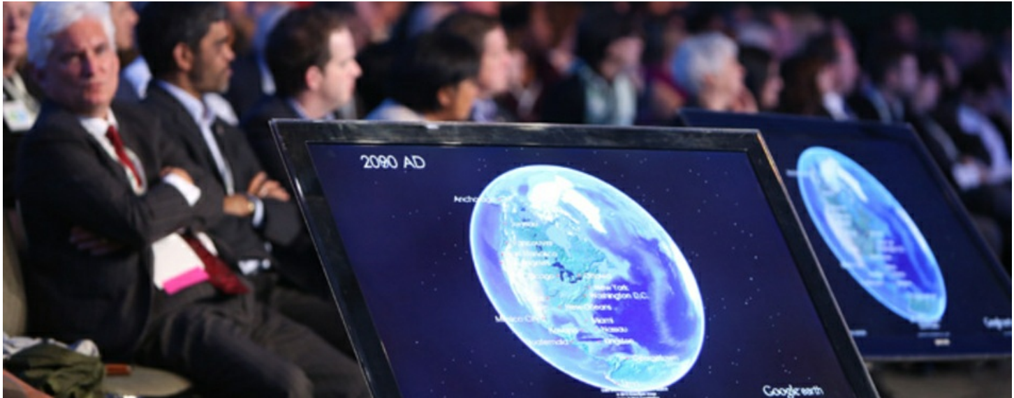
Greenbuild 2012 Closing Plenary