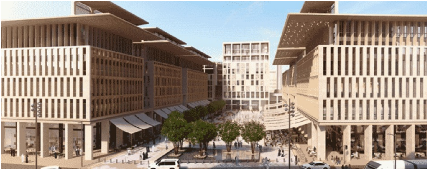
Msheireb Downtown Doha

In conjunction with the United Nations Framework Convention on Climate Change (UNFCCC) Conference of Parties 18 (COP18), the U.S. Green Building Council and Qatar Green Building Council would like to invite you to a special event on the growth of green building design and construction throughout the world. The event will highlight the notable Msheireb Downtown Doha. With the fifth greatest number of LEED registered and certified buildings outside the U.S., Doha is a fitting backdrop to discuss the booming green building industry and economy.