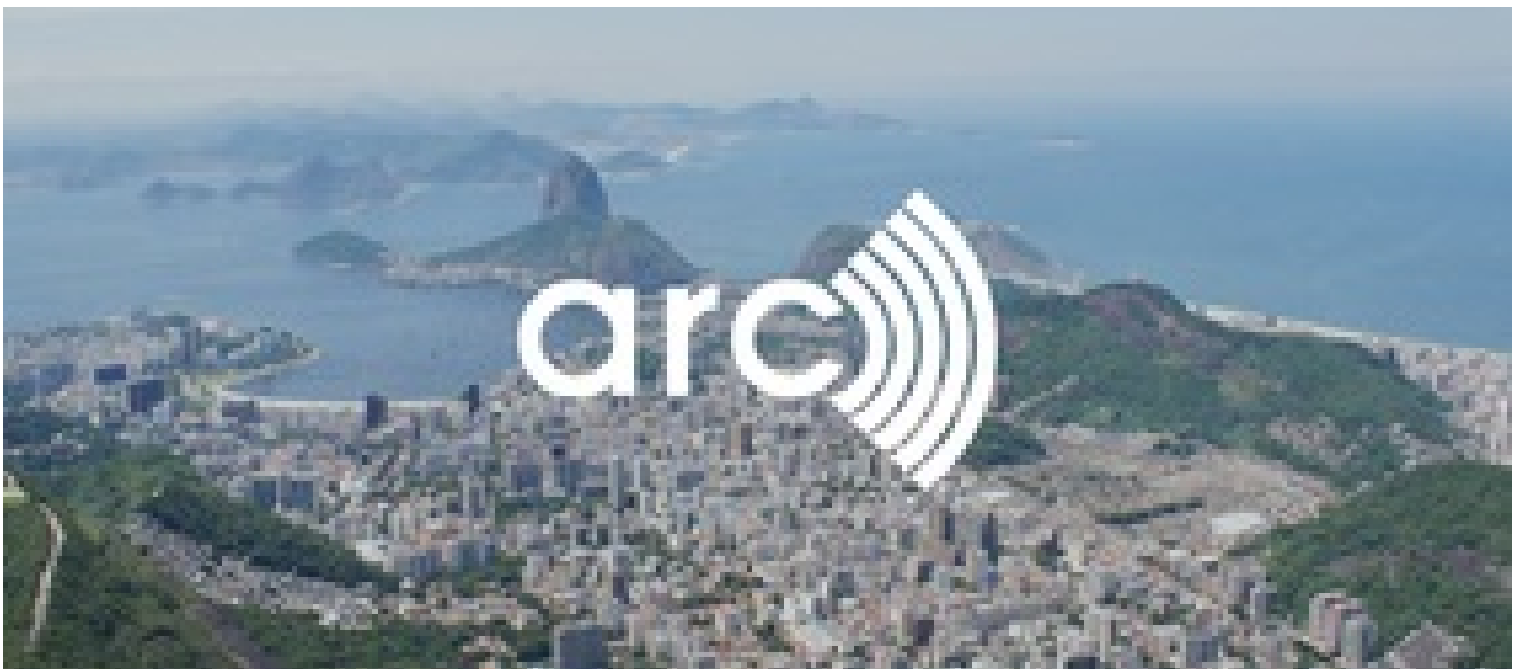
Greenwatch Latin America: Growing and innovating with Arc By Enzo Bomena