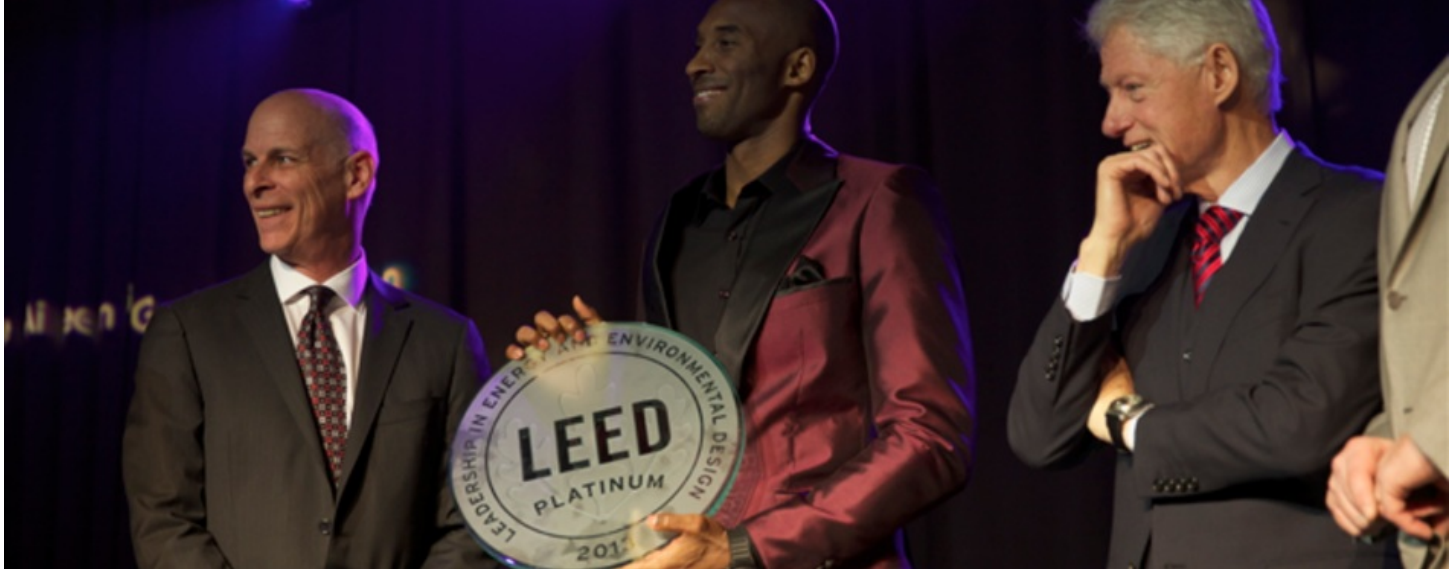
Kobe Bryant and President Clinton display the LEED Platinum plaque for the Step Up on Vine project.

It's not every day you see President Clinton & Kobe Bryant together holding a LEED plaque. But this Monday was no ordinary day.