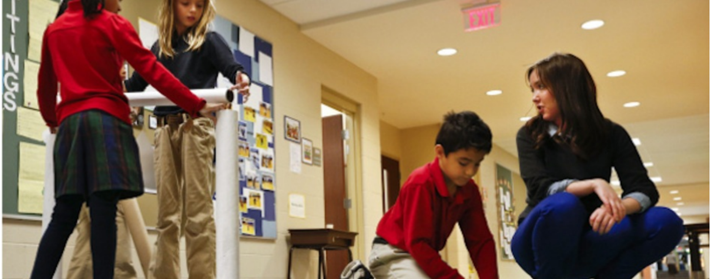
Ohio Chapters use the grant to expand research on the use of LEED for Ohio's schools.

They say it is better to give than to receive. Working with the USGBC Chapter network for the last five years, I sometimes feel like it's about equal. The staff and volunteers of our 77 Chapters give so much to the green building movement, providing their communities with education and resources to advance an ambitious mission . Their Green Schools Committees give their time, expertise and passion to bring healthy, safe and high-performing schools to every student, seldom asking for anything in return. That is why I love being a part of our Chapter grants program, where we at national are able to give back and support the local, state and regional programs being created and implemented day in and day out, specifically our Green Schools Grant, now in its fourth year.