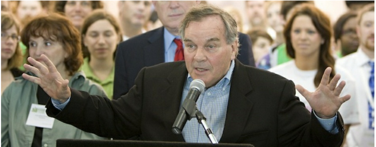
Former Chicago Mayor Richard Daley.

Here's our weekly collection of green building clips: