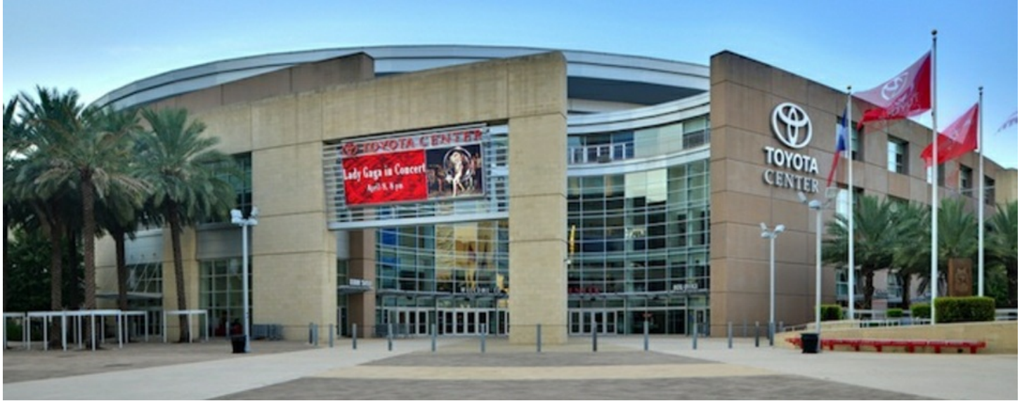
The LEED Silver Toyota Center in Houston, home of the Rockets.

Here's our weekly collection of green building clips: