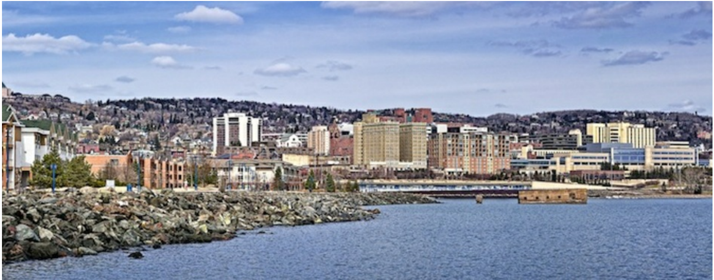
Duluth, Minnesota.

Here's our weekly collection of green building clips: