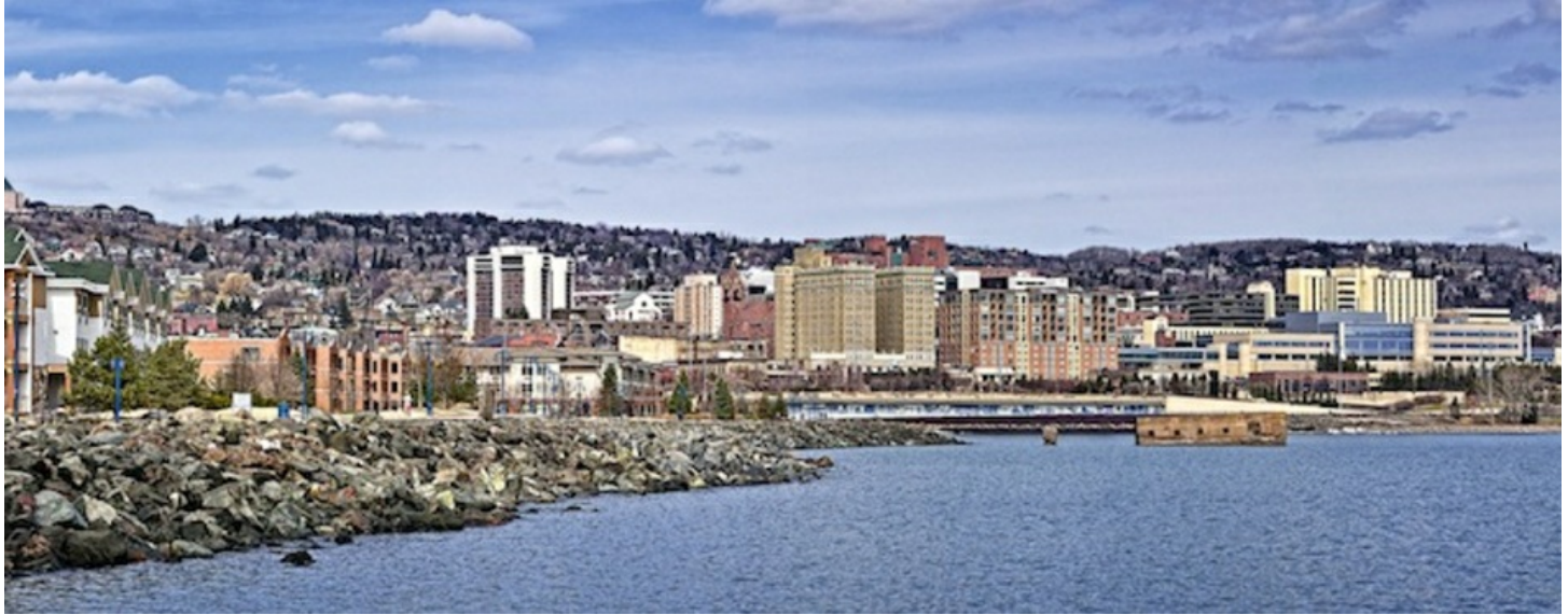
Duluth, Minnesota.

Here's our weekly collection of green building clips: