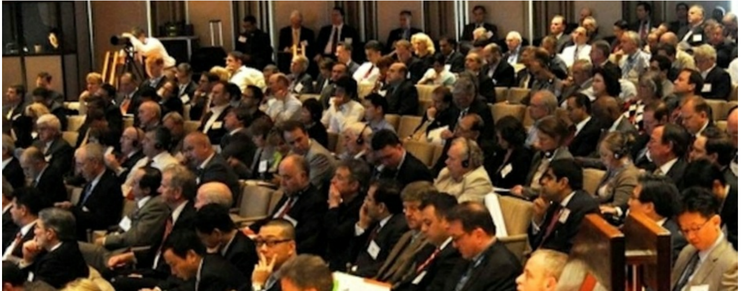
Global Construction Summit 2012

Join ENR at the Global Construction Summit in NYC June 6 – 7, 2013. This essential conference brings together industry professionals from major construction markets around the world to explore growth opportunities and investigate solutions to the most pressing challenges on the international playing field. Additionally, for the first time, Engineering News-Record will present the ENR Global Best Projects Awards , a new annual awards program dedicated to honoring the best global construction projects and the companies that designed and built them. For more information about registration and the conference, visit their website .