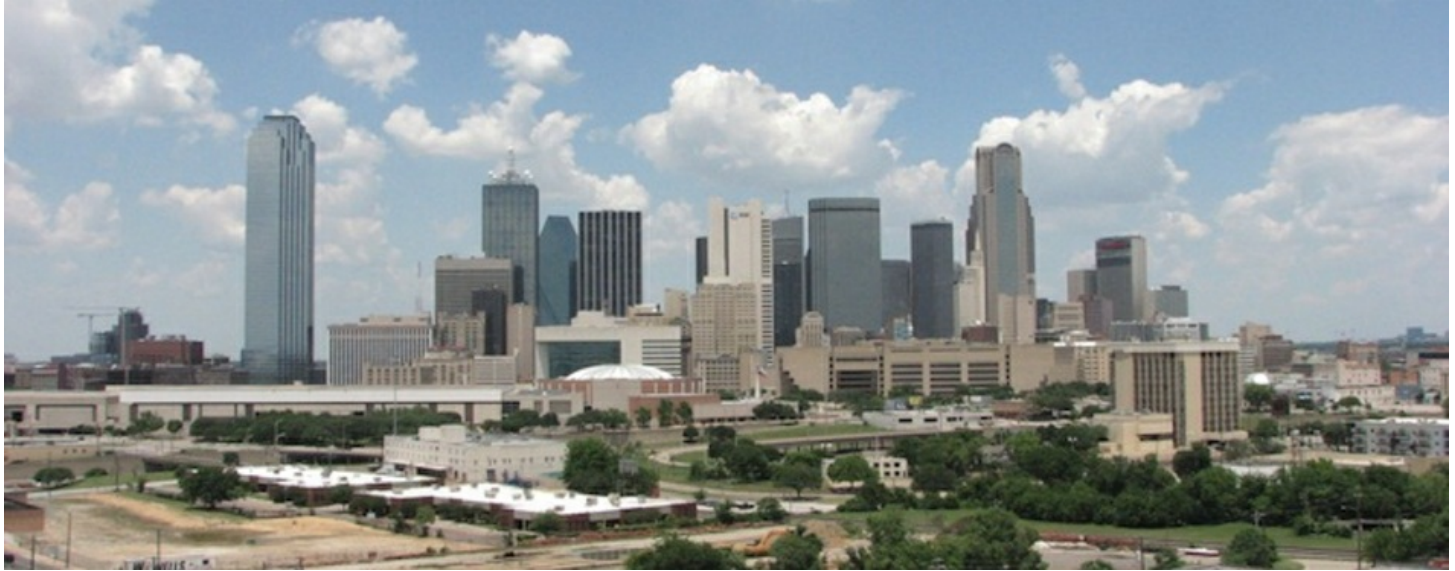
Dallas, home of the LEED Platinum George W. Bush Presidential Center.

Here's our weekly collection of green building clips: