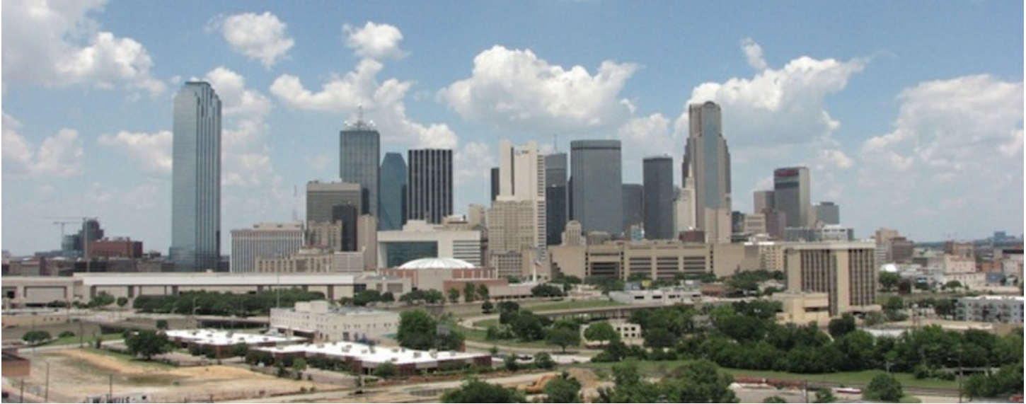
Dallas, home of the LEED Platinum George W. Bush Presidential Center.

Here's our weekly collection of green building clips: