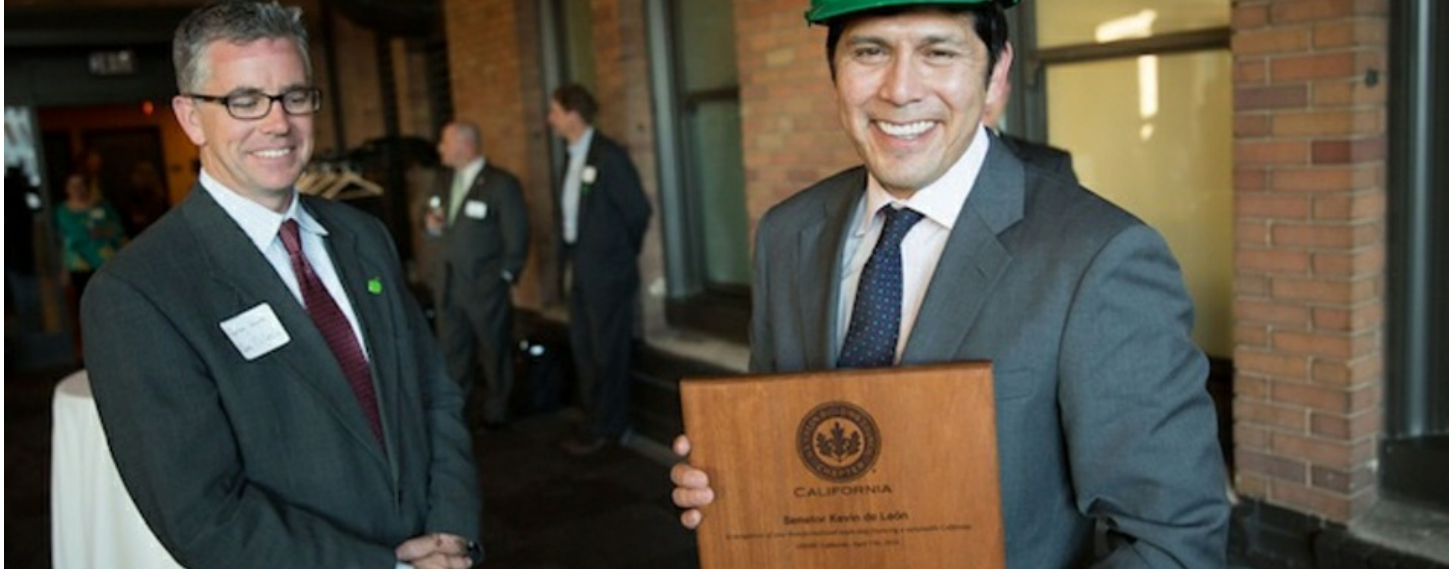
CA State Senator Kevin de León receives USGBC California's 2013 Green Hard Hat Award last week.

After last year's epic USGBC California Road to Greenbuild/ "Top10" Advocacy Day , more than one commentator posed the "how can we top this?" question. It turns out that there was little need to worry. This year's model, PolicyPalooza 2013, was bigger, better and bolder, comprising three full days of meetings, sessions and convening.