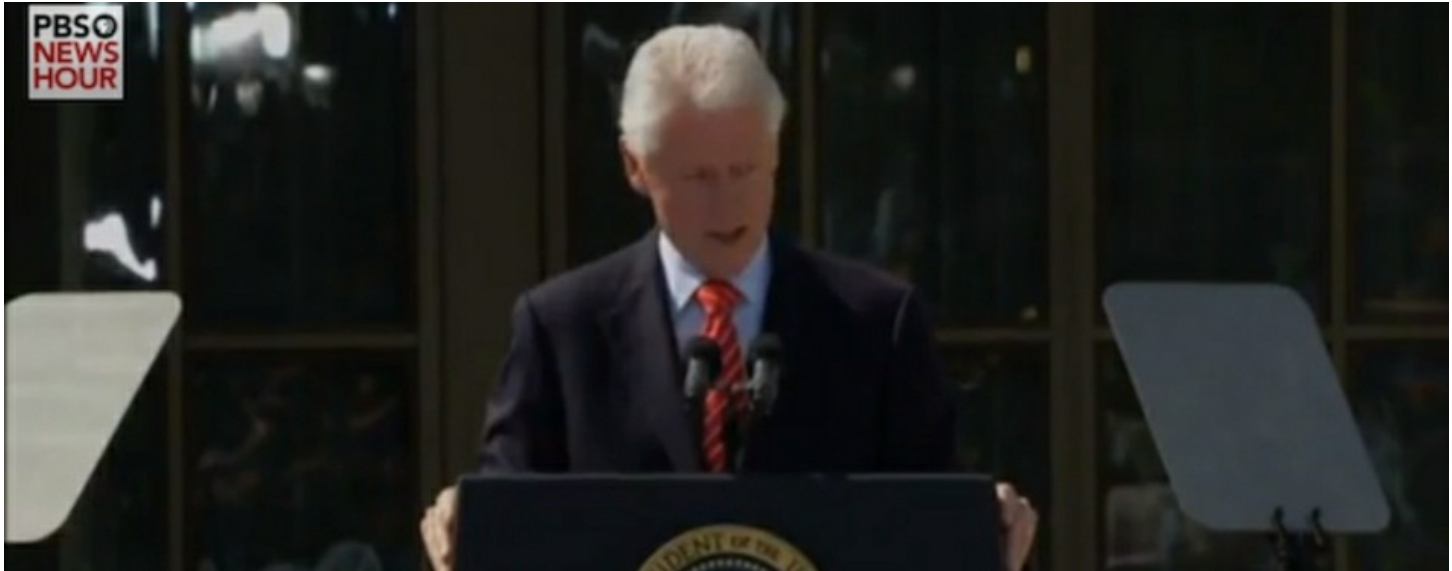
President Bill Clinton speaks at the opening of the LEED Platinum George W. Bush Presidential Center in Dallas.

Watch President Bill Clinton speak at the dedication of the George W. Bush Library , PBS News. Speaking at the opening of the George W. Bush Presidential Center in Dallas, President Clinton highlighted the facility's fantastic achievement: LEED Platinum for New Construction.