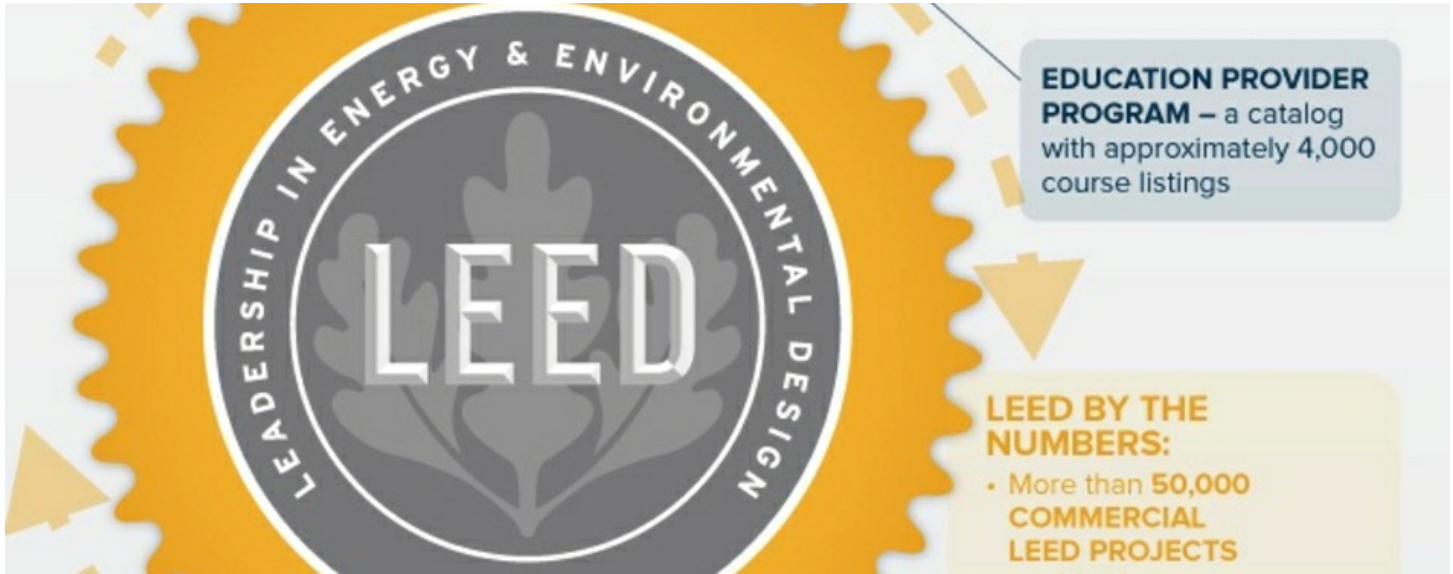
LEED in Motion

USGBC has released a new infographic to illustrate how the LEED green building rating system has contributed to the growth of an entire global industry devoted to creating a sustainable built environment.