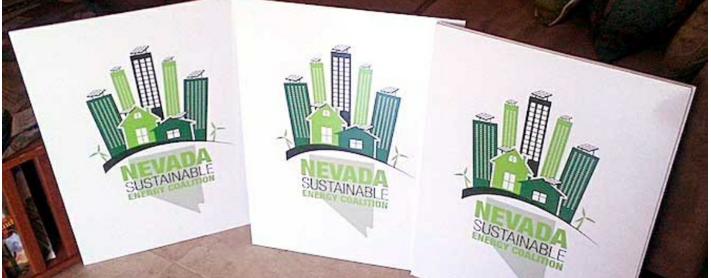
Nevada Advocacy Day