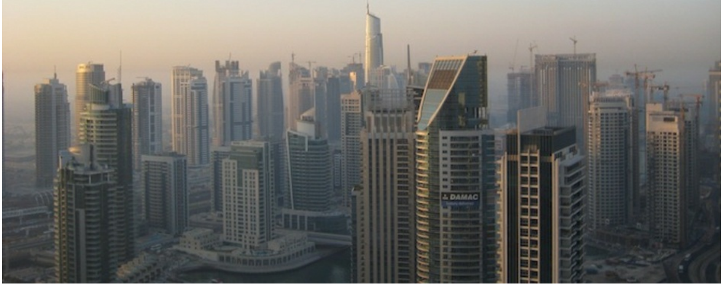
The Dubai skyline.

Here's our weekly collection of green building clips: