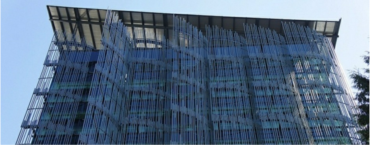
The Edith Green-Wendell Wyatt Federal Building in Portland.

Here's our weekly collection of green building clips: