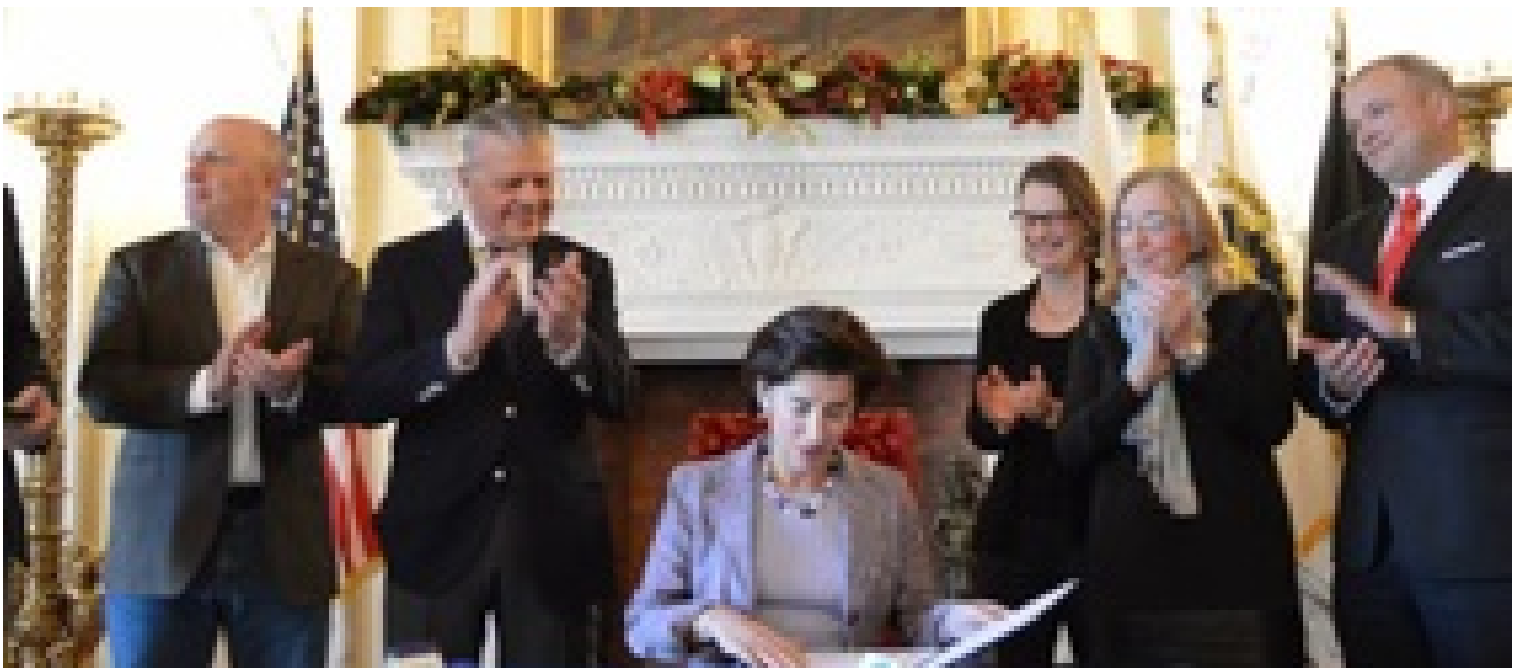
SITES and LEED ND added to Rhode Island Green Buildings Act