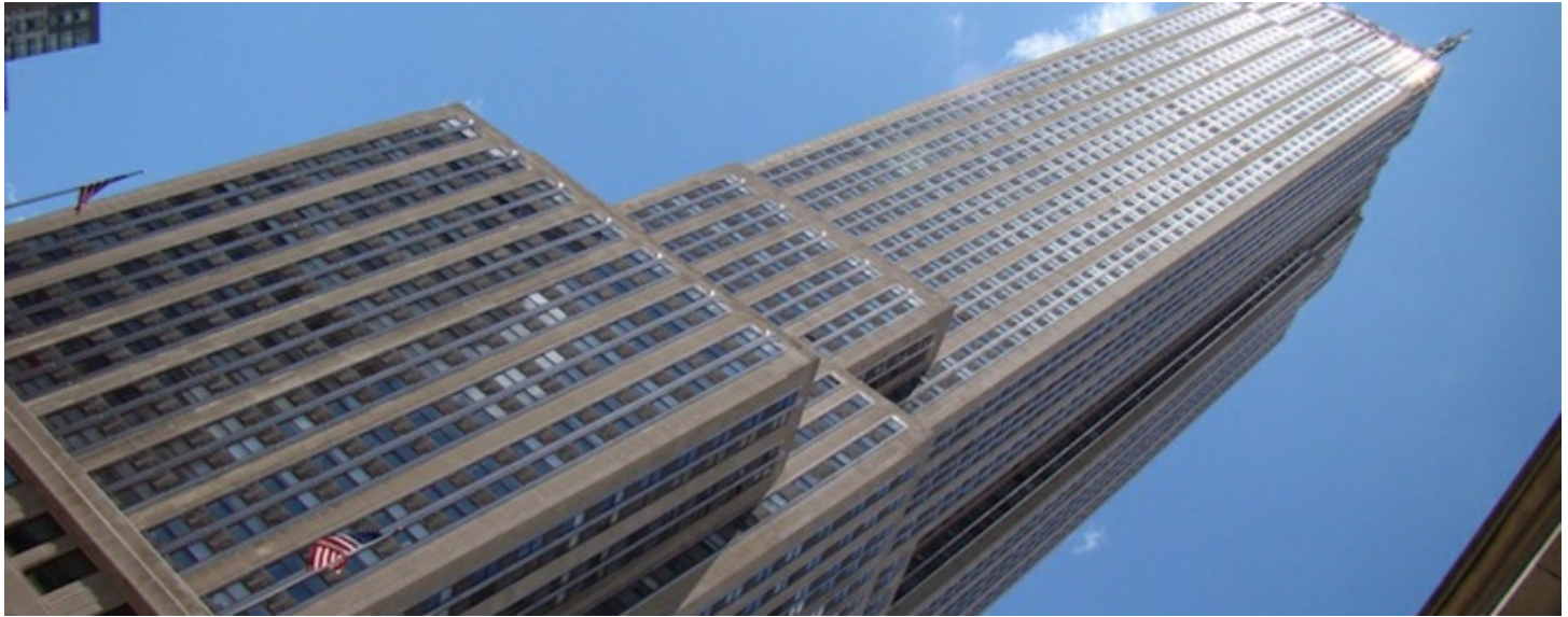
The Empire State Building.

Here's our weekly collection of green building clips: