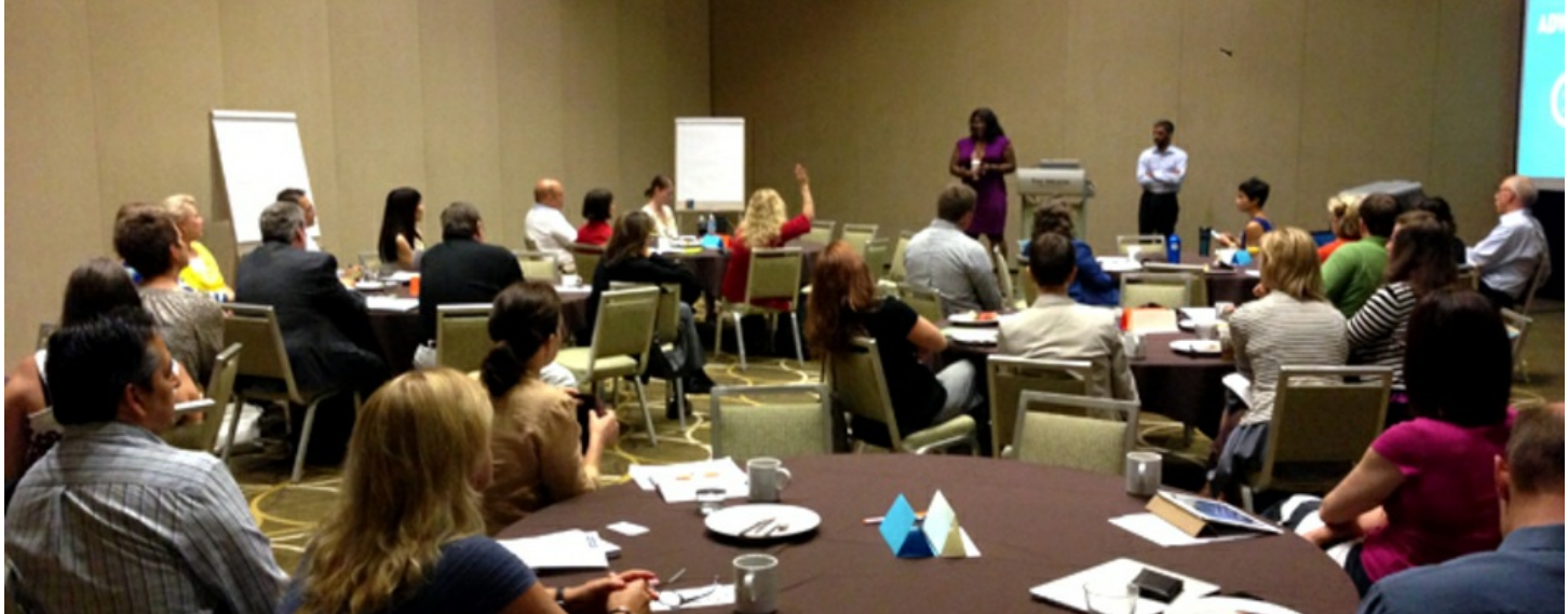
Q&A at the Mid Year Meeting

For the third year running, USGBC dove into summer by convening our key volunteer leadership from across the country and even a few from other parts of the world at our annual mid-year meeting (affectionately known by the USGBC team as MYM). This year, our community descended upon steamy Indianapolis, Indiana, which managed to be hotter than the other two previous two locations – Stone Mountain, GA and San Antonio, TX.