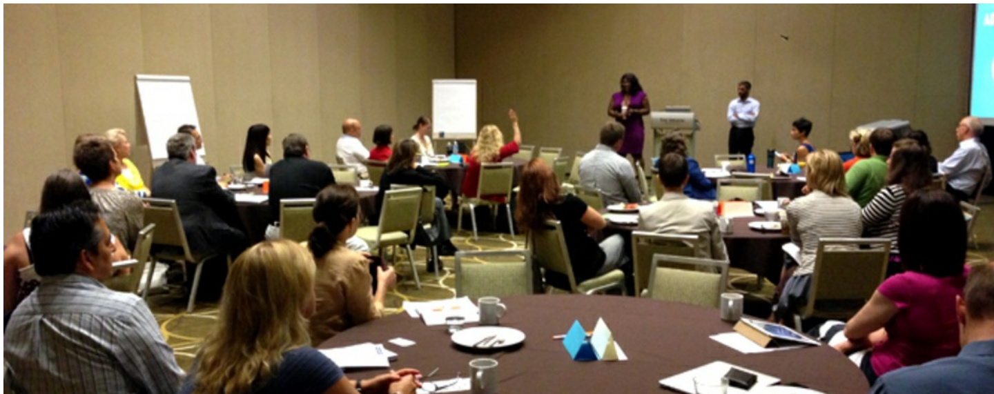
Q&A at the Mid Year Meeting

For the third year running, USGBC dove into summer by convening our key volunteer leadership from across the country and even a few from other parts of the world at our annual mid-year meeting (affectionately known by the USGBC team as MYM). This year, our community descended upon steamy Indianapolis, Indiana, which managed to be hotter than the other two previous two locations – Stone Mountain, GA and San Antonio, TX.