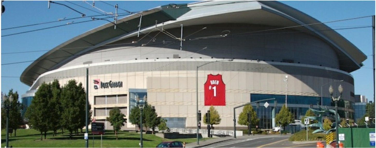
The LEED Gold-certified Rose Garden in Portland, home of the Trail Blazers.

Here's our weekly collection of green building clips: