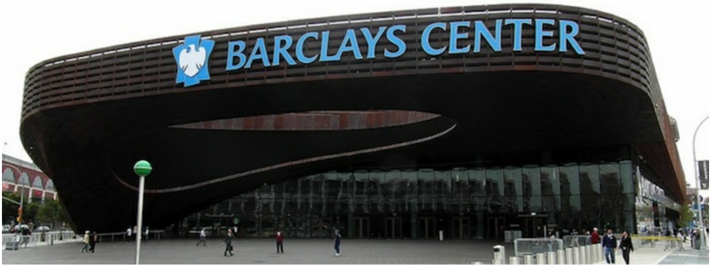
The LEED Silver Barclays Center in Brooklyn.

Here's our weekly collection of green building clips: